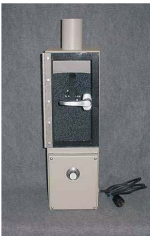
Remote Blower option

An economical alternative for customers who want the benefits of a pneumatic tube system and have the resources to “DO IT YOURSELF.”